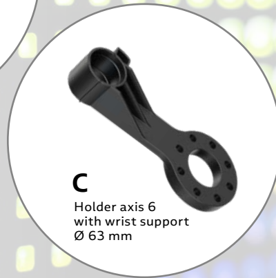
C Holder axis 6 with wrist support Ø 63 mm