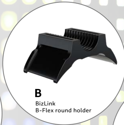
B BizLink B-Flex round holder