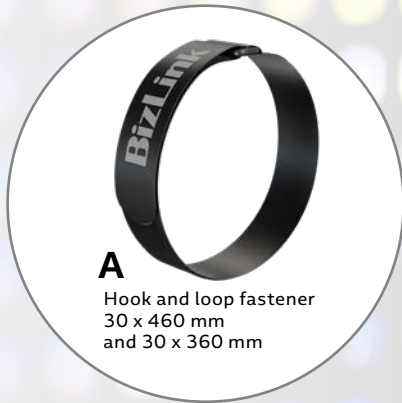
A Hook and loop fastener 30 x 460 mm and 30 x 360 mm